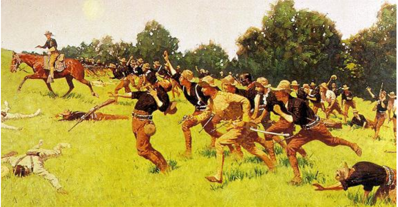
Frederick Remington, Charge of the Rough Riders at San Juan Hill